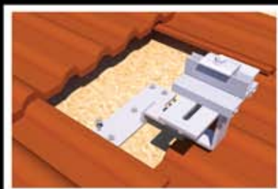
REMOVE TILE AND ATTACH TO ROOF